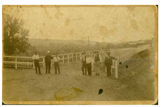
A DECADE OF THE LLOYD FAMILY WORKING DIARY