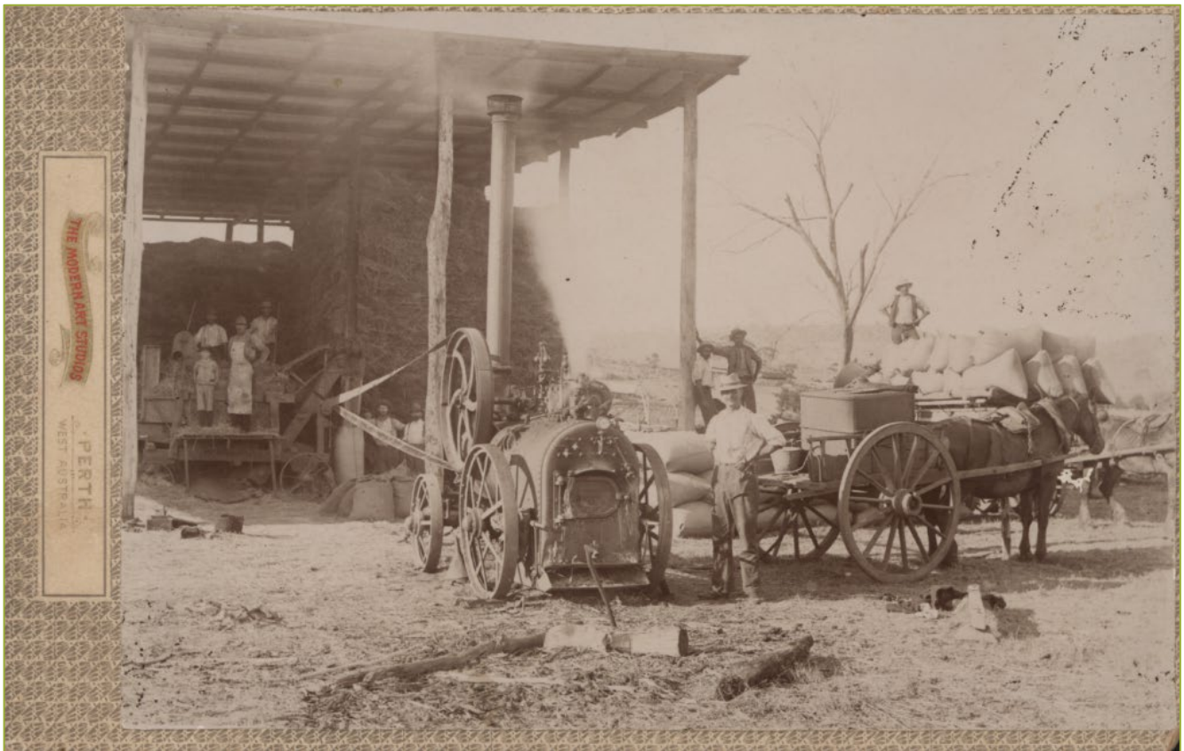
Harvesting, threshing, carting scene, c. 1900

Shire of Toodyay local history collection 2000.56