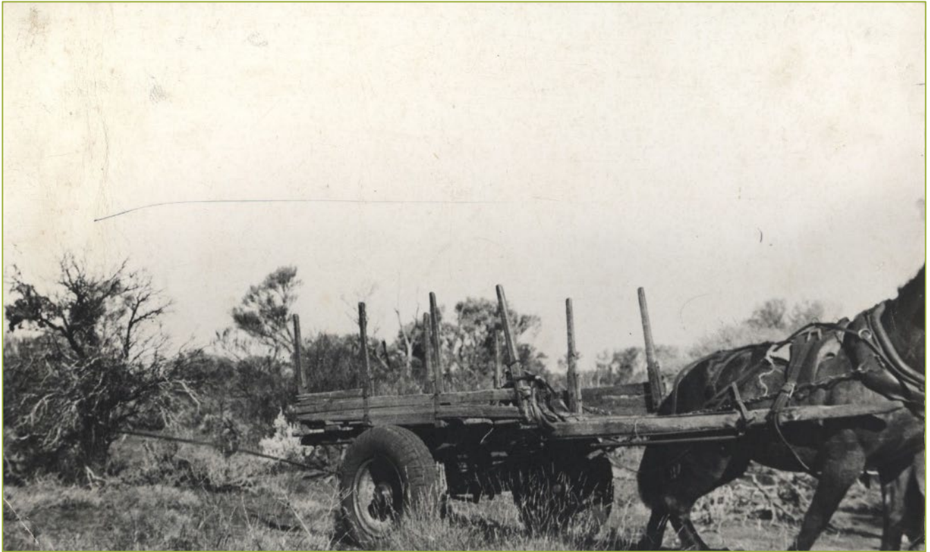
Tree removal (probably sandalwood), horse and cart

2000.56