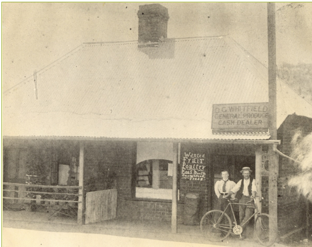
Oliver Whitfield's produce store, with Oliver Whitfield and wife Eva in front.